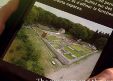
The museum and the archaeological site of Bibracte Saint-Léger-sous-Beuvray

La reprise des fouilles en 1988 permet de corriger le plan de Bulliot sur des points de détail et d'affiner la fonction des différents espaces.